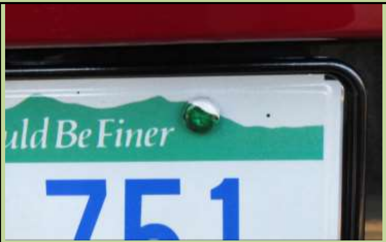
Pic with painted cap