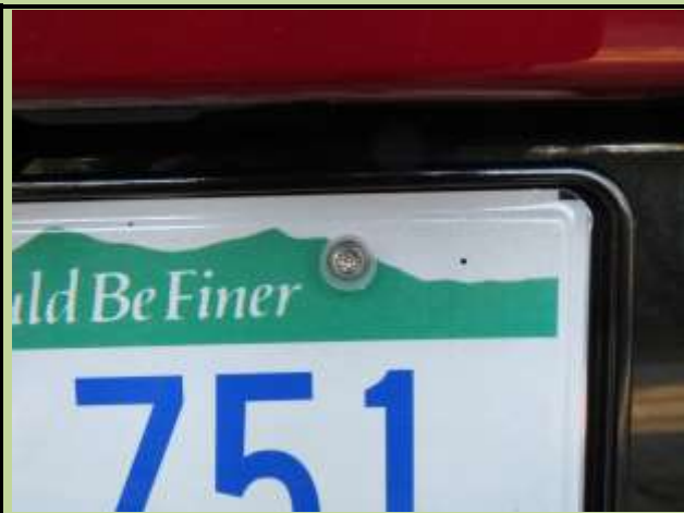
Pic without cap