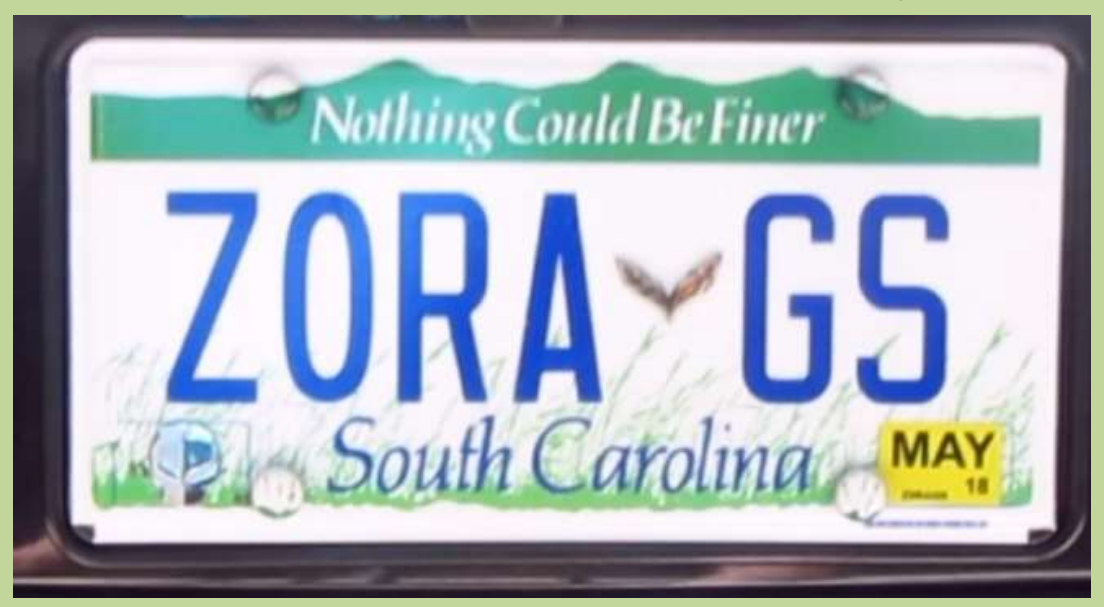
2014 C7 Z51: Engine was an LT1

Note: I painted the screw caps to match the plate background