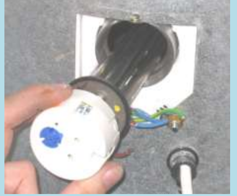
That is not an actual photo of what I did with a tank full of water but it does show what was done.